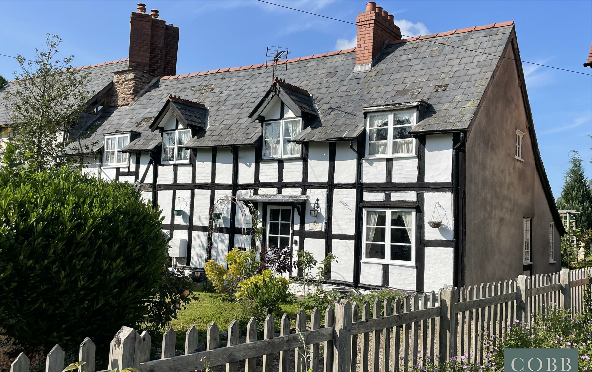
The Haven, Bodenham, Hereford, HR1 3HR Price £330,000